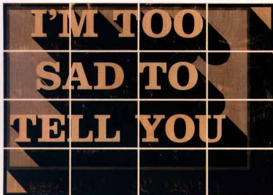
'I'm Too Sad To Tell You' (after Bas Jan Ader) Paint on wood, 841 x 1189mm

I don't have a specific process that I can describe for composing words. It's usually some kind of balance between form and content, but it also has a lot to do with tautological thoughts and ideas. The expression 'exclude nothing, say nothing' captures the moment I'm aiming for within the work, whether it be linguistic, or pictorial. Banality as an idea has also been an important framework, but what that really means is hard to define.